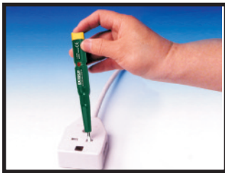
Voltage check in an outlet