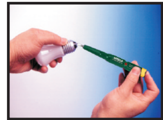
Light Bulb Continuity Check