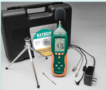
Meter and accessories are packaged in a rugged hard carrying case for added protection