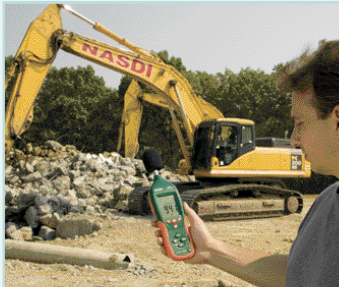
Meets new IEC 61672-1 Class 2 accuracy standard for OSHA and other local and national noise ordinances