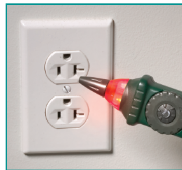
Built-in Non-Contact Voltage Detector automatically detects a live wire when the red LED is lit