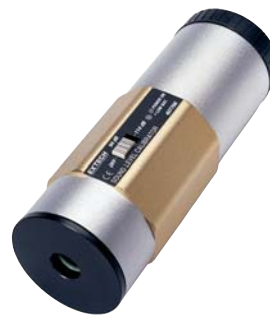
Optional Precision Calibrator 94dB/114dB fits 1/2" or 1" microphones - enables user to calibrate through the microphone